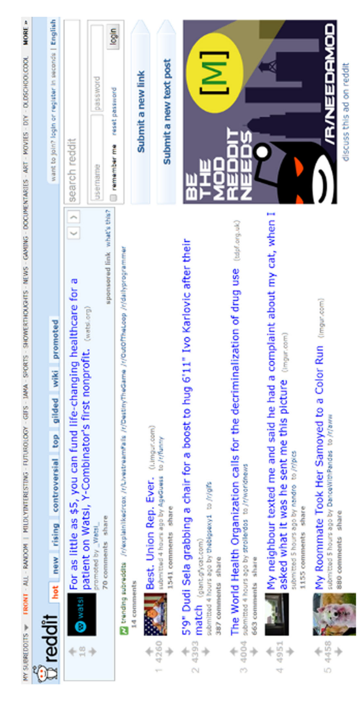
Figure 2. Screenshot of Reddit's Front Page, from 2014